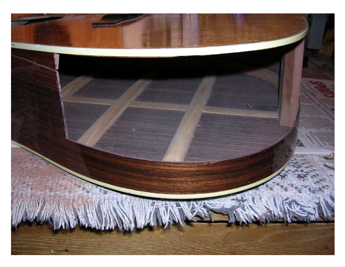
Damaged Area Removed