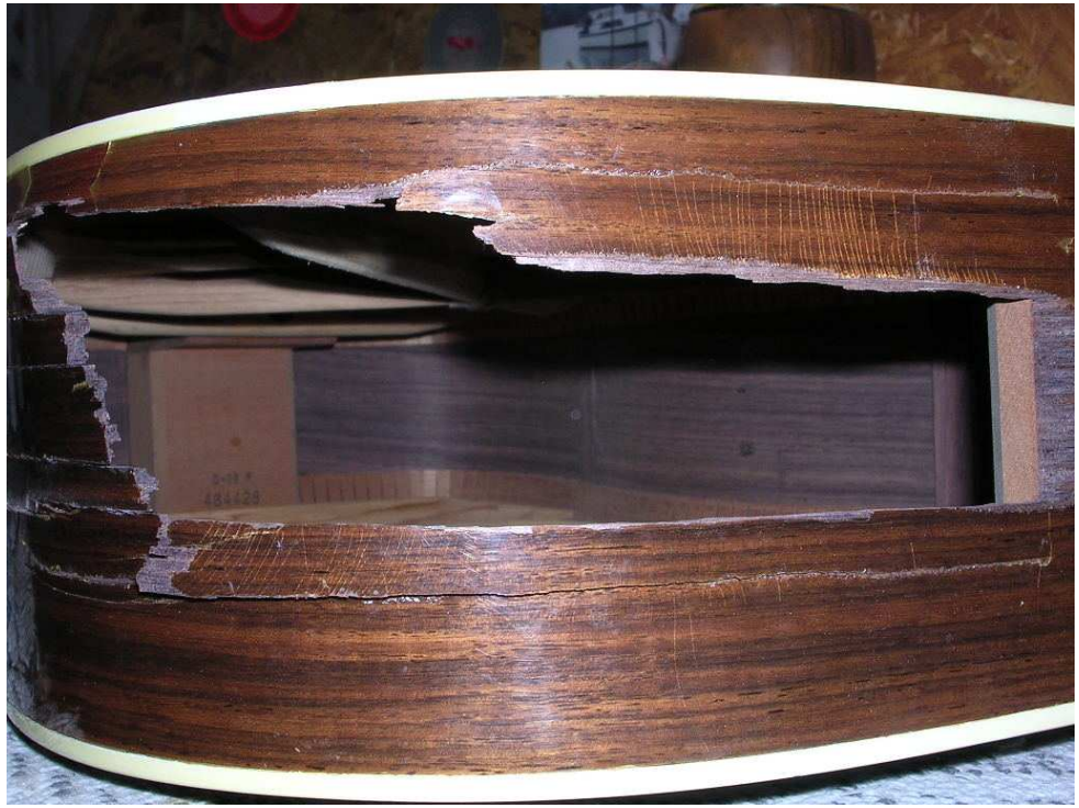
Rather extensive damage