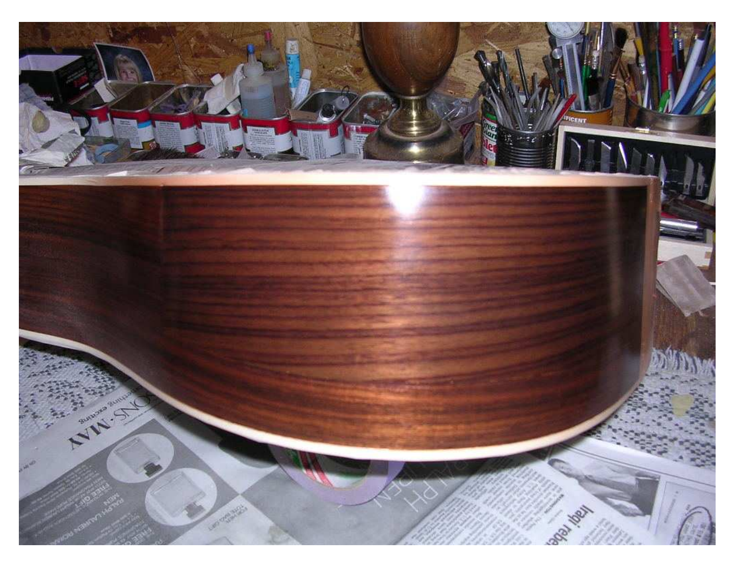
Extreme Guitar Repair

I got a set of rosewood replacement sides from Martin in order to match the curve and wood type. The grain did not match all that well but as you can see the finished repair is barely visible. Due to the way I backed and re-enforced the patch, the repair is stronger than the original unbroken wood.